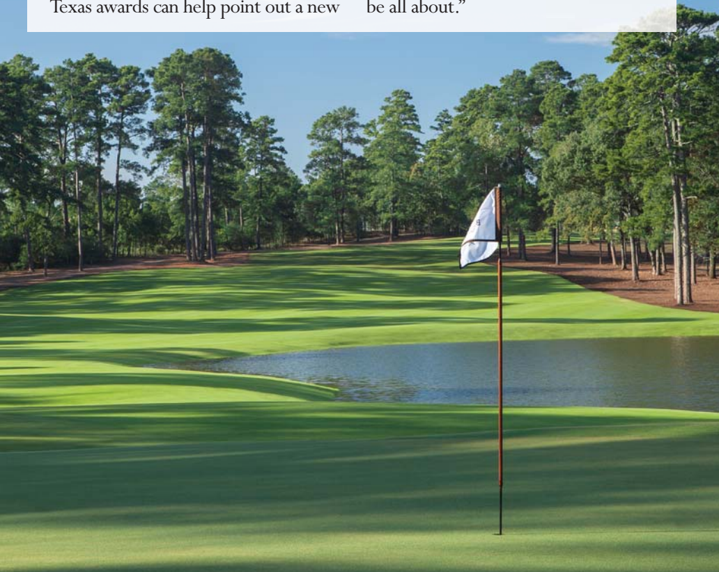
Hole 1 - Par 4, 458 yards