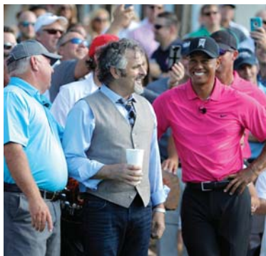
Mark O'Meara, David Feherty & Tiger Woods