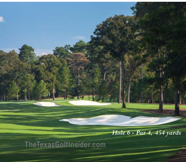
Hole 6 - Par 4, 454 yards

Golf Magazine/Sports Illustrated praised Bluejack National in its golf publication for its "fun, option-filled track that emphasizes width, angles, contours and recover-