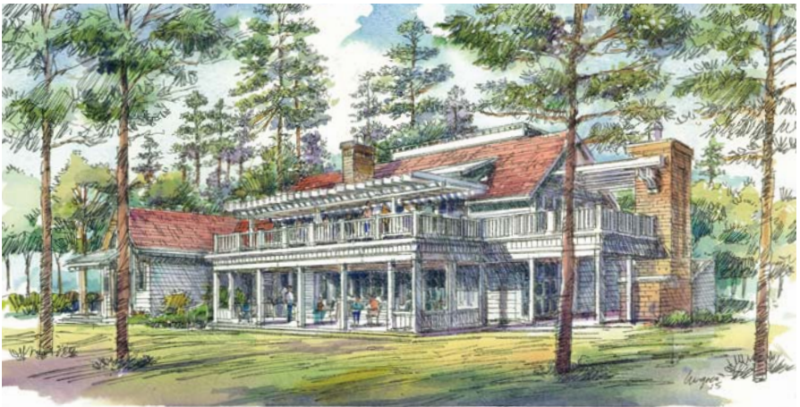
Bluejack National Clubhouse, “The Porch”

For more information on the award-winning course and unique Texas family facility, go to www.bluejacknational.com or call (281) 475-2165.