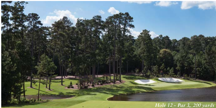
Hole 12 - Par 3, 200 yards

Another key factor in the 'golf is fun' mantra here is the 10-hole Playgrounds short course. With no holes over 120 yards, where players, members and guests can warm up, shorten their shot game and settle all bets, the fun is contagious.