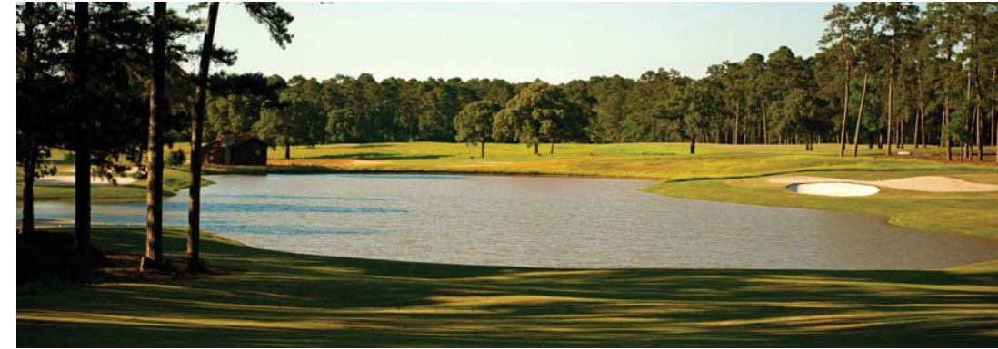
Bluejack National is a player- and family-friendly course with large fairways. The pictured pond is one of only a few water hazards.

From professionals to amateurs, Woods’ Bluejack practice facilities cover all stages of the game. ■